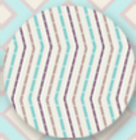
BA-306 Moroccan Streets Day