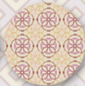
BA-408 Mosaic Cream