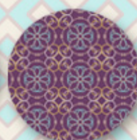
BA-309 Mosaic Purple