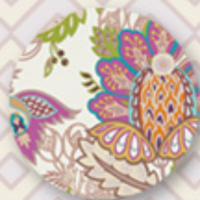
BA-400 Exotic Flora Rich