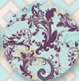
BA-303 Bellydancer Sky