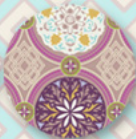
BA-302 Medallion Iron