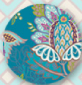
BA-300 Exotic Flora Deep