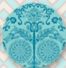
BA-304 Imperial Turquoise