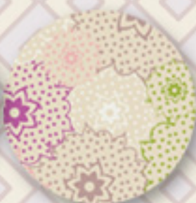
BA-405 Sahara Stars Pink