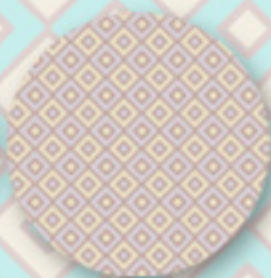
BA-307 Moorish Rug Lilac