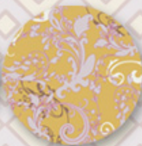
BA-403 Bellydancer Sand