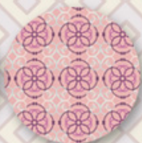
BA-410 Mosaic Rose