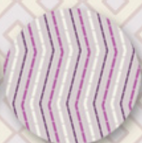
BA-406 Moroccan Streets Night