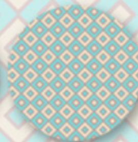
BA-308 Moorish Rug Aqua