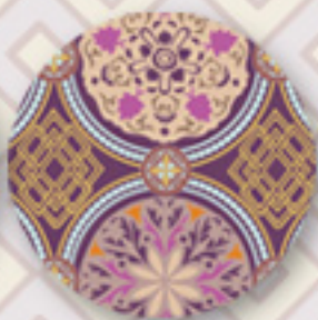
BA-402 Medallion Golden