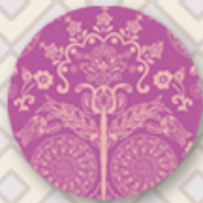
BA-404 Imperial Fuschia