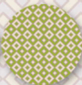
BA-407 Moorish Rug Green