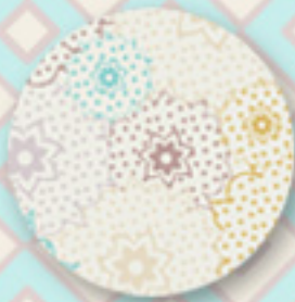
BA-305 Sahara Stars Blue