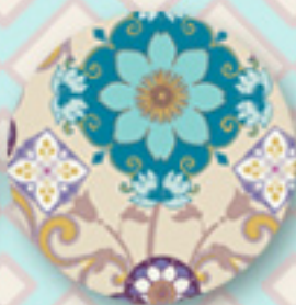
BA-301 Gems Ocean