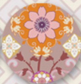
BA-401 Gems Terra