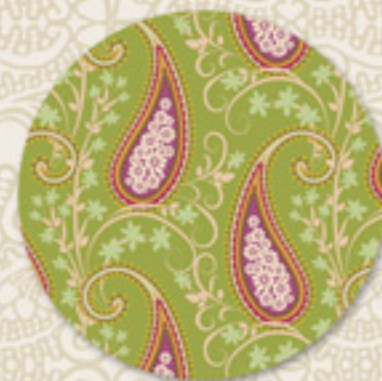
BOH-503 Rhapsody Day