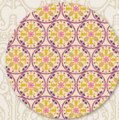
BOH-604 Caravan Purple