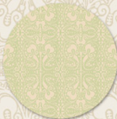
LAE-1305 Mist Lace