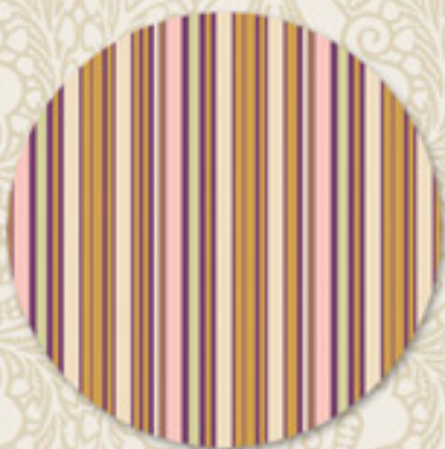
BOH-607 Destiny Road Ocher