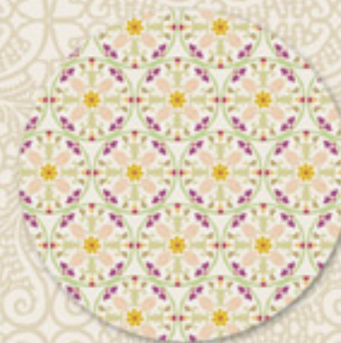
BOH-504 Caravan Green