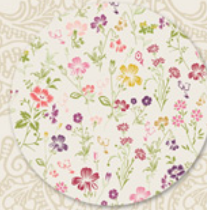
BOH-605 Ditsy Bright