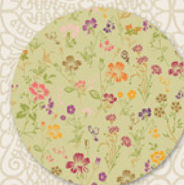
BOH-505 Ditsy Mellow