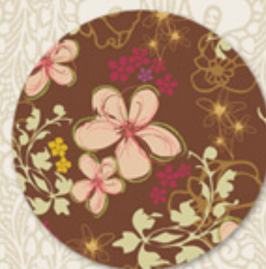
BOH-501 Twirls in the Woods