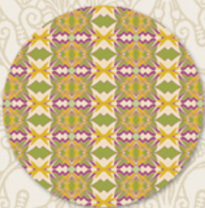
BOH-606 Tribal Foliage