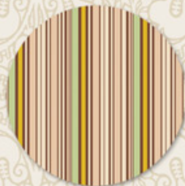
BOH-507 Destiny Road Palm