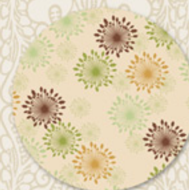
BOH-502 Endless Dream Hay