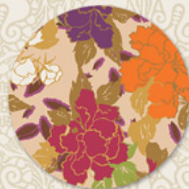
BOH-500 Mystic Light