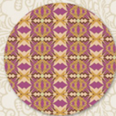
BOH-506 Tribal Terra