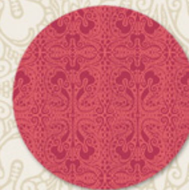
LAE-1301 Cherry Lace