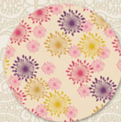
BOH-602 Endless Dream Shine