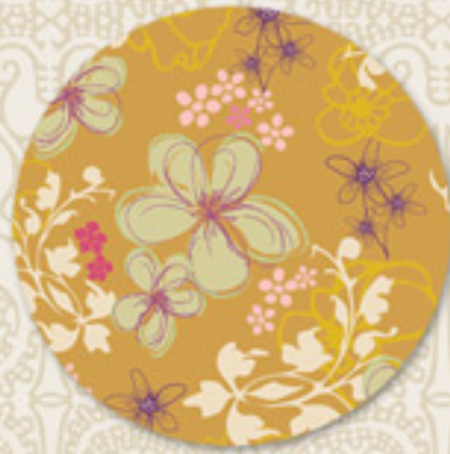
BOH-601 Twirls in the Sun