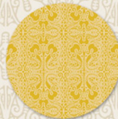
LAE-1300 Gold Lace