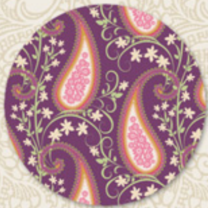
BOH-603 Rhapsody Night