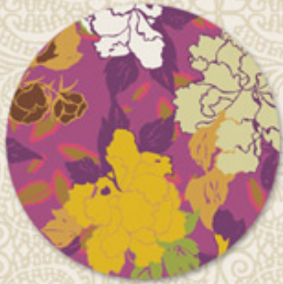
BOH-600 Mystic Dark