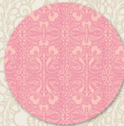
LAE-1304 Pink Lace