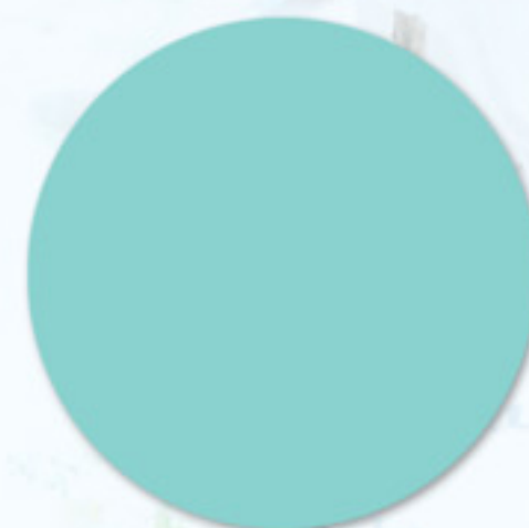
PE-403 Fresh Water