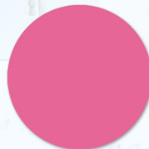
PE-404 Festival Fuchsia