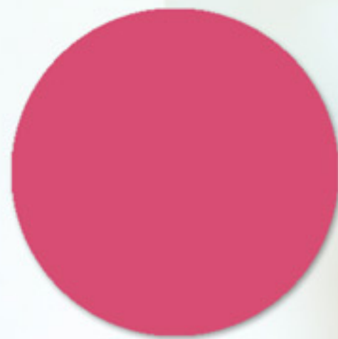
PE-405 Cherry Lipgloss