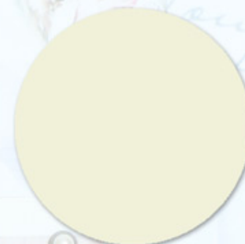
PE-408 Linen White