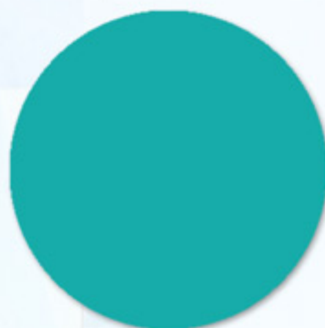
PE-402 Cozumel Blue