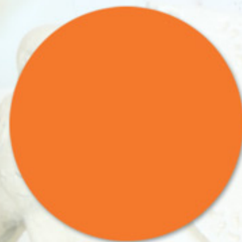
PE-406 Burnt Orange