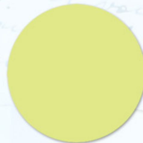
PE-409 Light Citron