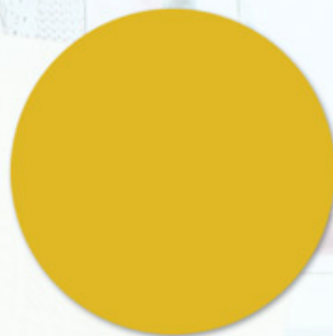
PE-407 Empire Yellow