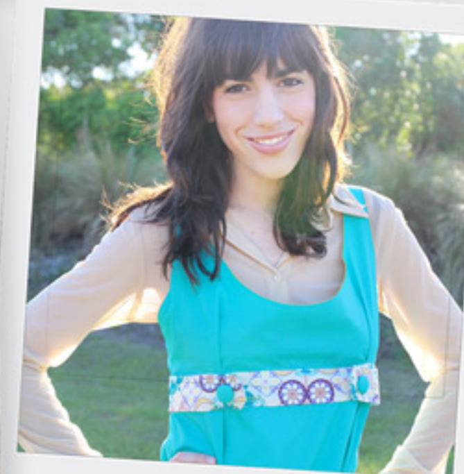
A bright sundress for spring!

Looking for a clean, modern look for your projects? How about mixing Pure Elements with floral patches? Or maybe a subtle trim for a blouse? Accentuate all your projects with these new vibrant solids, with the signature Art Gallery Fabrics quality.