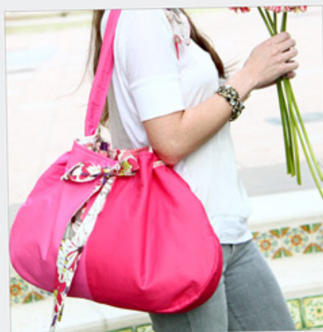
A Capri bag!